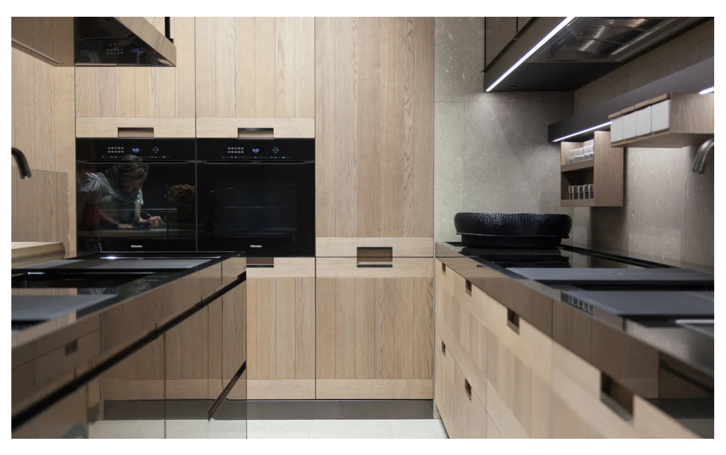
Colours and brightness of video and printed reproductions are indicative. The slab simulates natural stone so, some changes are possible in the final product.